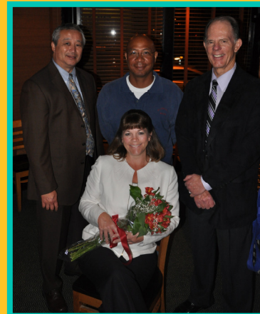
Top & Middle : Altrusans and Guests